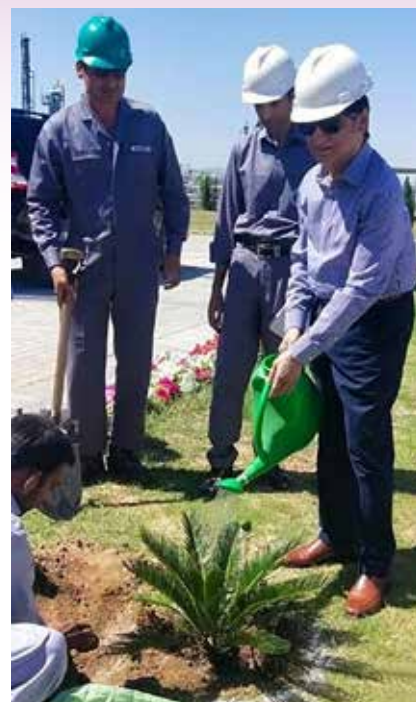
MD Planting a Sapling at Dakhni Oil & Gas Processing Plant, District Attock.

(One Fireman is assigned to check the crude oil & LPG vehicles & two are assigned in case of any hot job & fourth maintains fire gadgets.)